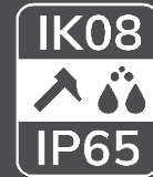
Robust & Secure